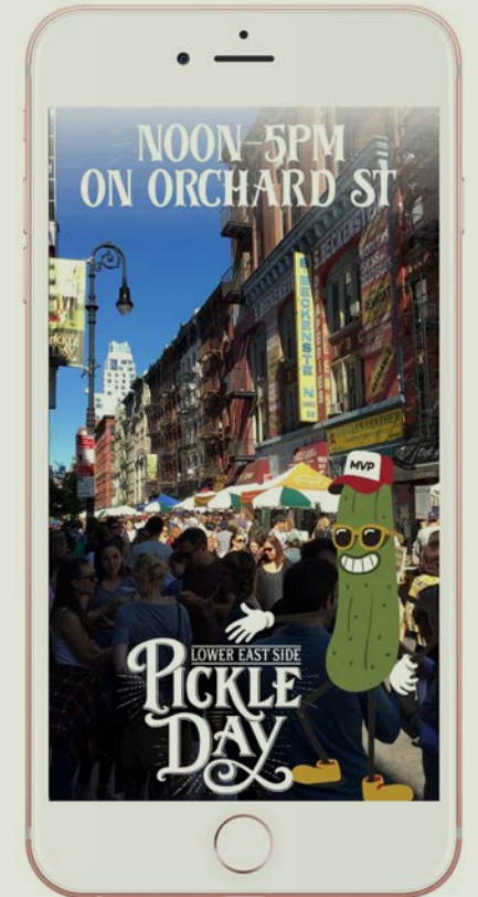
SOCIAL MEDIA FILTERS