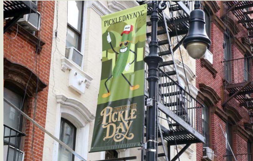
LIGHTPOST BANNERS THROUGHOUT LES