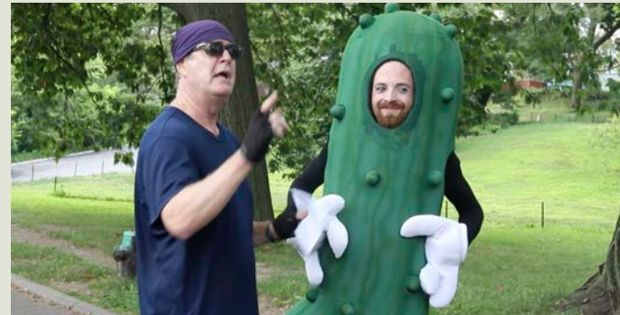
STREET TEAM FLYERING