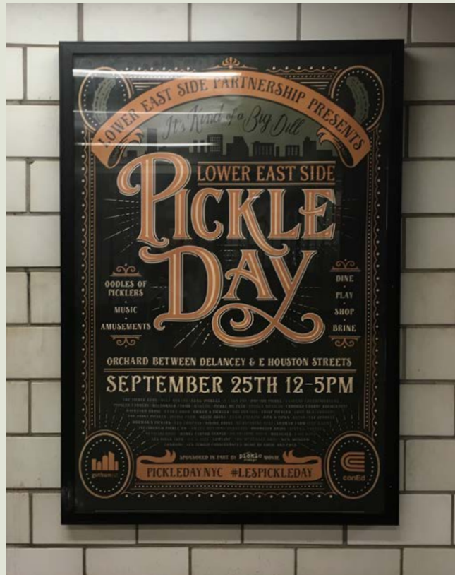
SUBWAY STATION AD BUYS